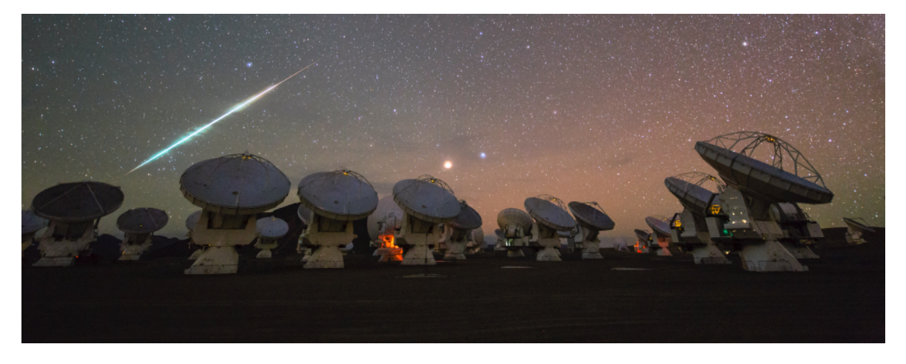
Figure 14.2 Fireball. When a larger piece of cosmic material strikes Earth's atmosphere, it can make a bright fireball. This time-lapse meteor image was captured in April 2014 at the Atacama Large Millimeter/Submillimeter Array (ALMA). The visible trail results from the burning gas around the particle.