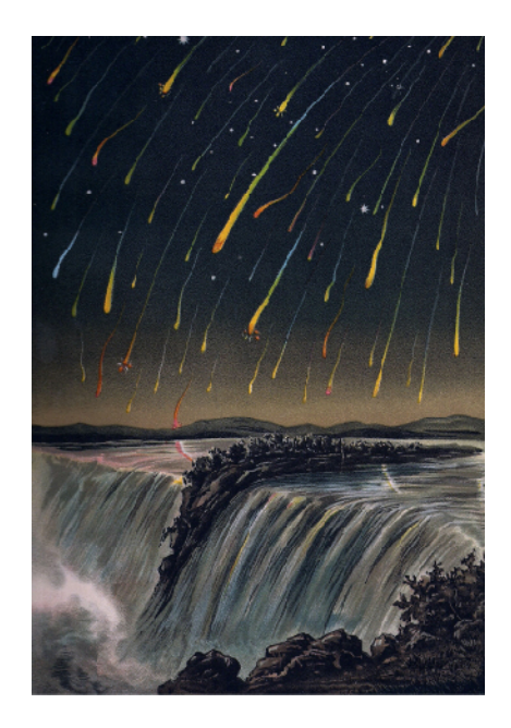
Figure 14.4 Leonid Meteor Storm. A painting depicts the great meteor shower or storm of 1833, shown with a bit of artistic license.

The most dependable annual meteor display is the Perseid shower, which appears each year for about three nights near August 11. In the absence of bright moonlight, you can see one meteor every few minutes during a typical Perseid shower. Astronomers estimate that the total combined mass of the particles in the Perseid swarm is nearly a billion tons; the comet that gave rise to the particles in that swarm, called Swift-Tuttle, must originally have had at least that much mass. However, if its initial mass were comparable to the mass measured for Comet Halley, then Swift-Tuttle would have contained several hundred billion tons, suggesting that only a very small fraction of the original cometary material survives in the meteor stream.