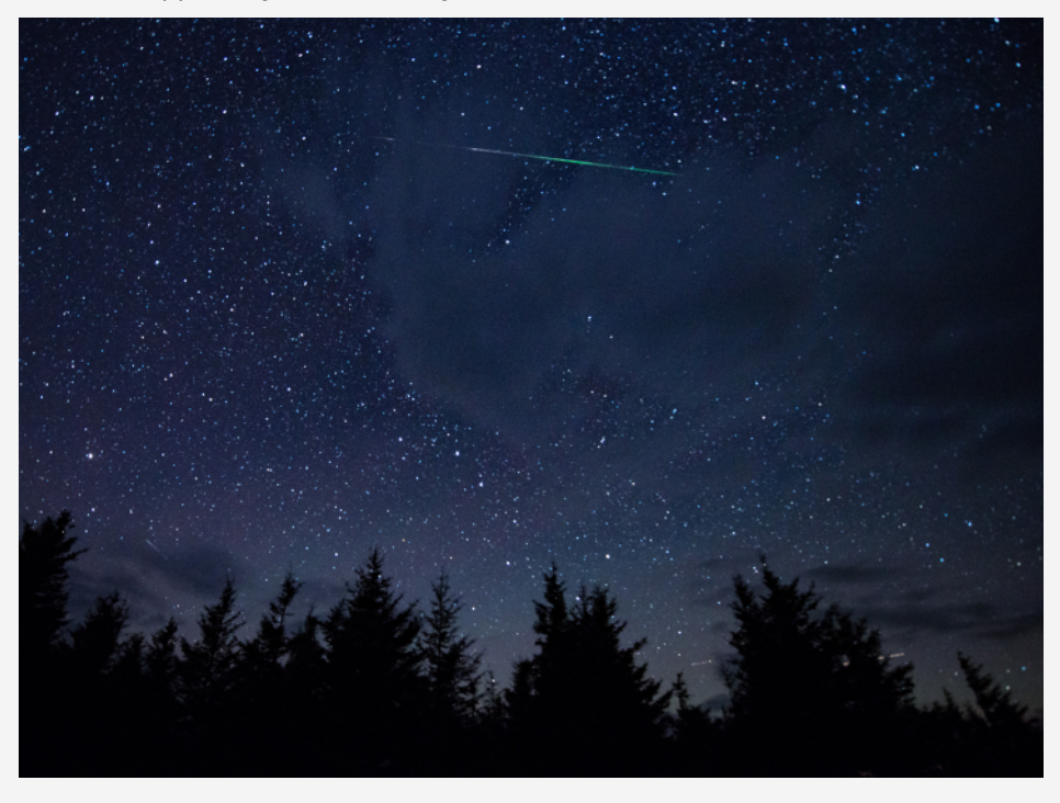
Figure 14.5 Perseid Meteor Shower. This twenty-second exposure shows a meteor during the 2015 Perseid meteor shower.

Observing a meteor shower is one of the easiest and most enjoyable astronomy activities for beginners (Figure 14.5). The best thing about it is that you don't need a telescope or binoculars—in fact, they would positively get in your way. What you do need is a site far from city lights, with an unobstructed view of as much sky as possible. While the short bright lines in the sky made by individual meteors could, in theory, be traced back to a radiant point (as shown in Figure 14.3), the quick blips of light that represent the end of the meteor could happen anywhere above you.